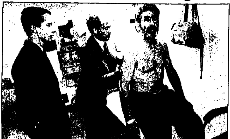
A Red Cross doctor examines a prisoner in the Falklands war

continued from previous page... Ignored. It was as if the parts of the legal whole lacked connection with each other, and the body as a whole lacked life.